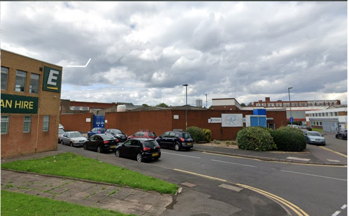
Unit A3 | Radshape | Shefford Rd | Birmingham | B6 4PL