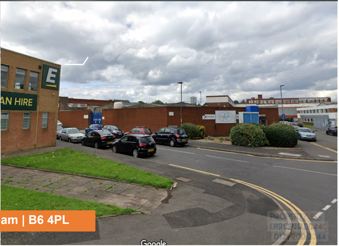
Units A2 & A4 | Radshape Park | Shefford Rd | Birmingham | B6 4PL