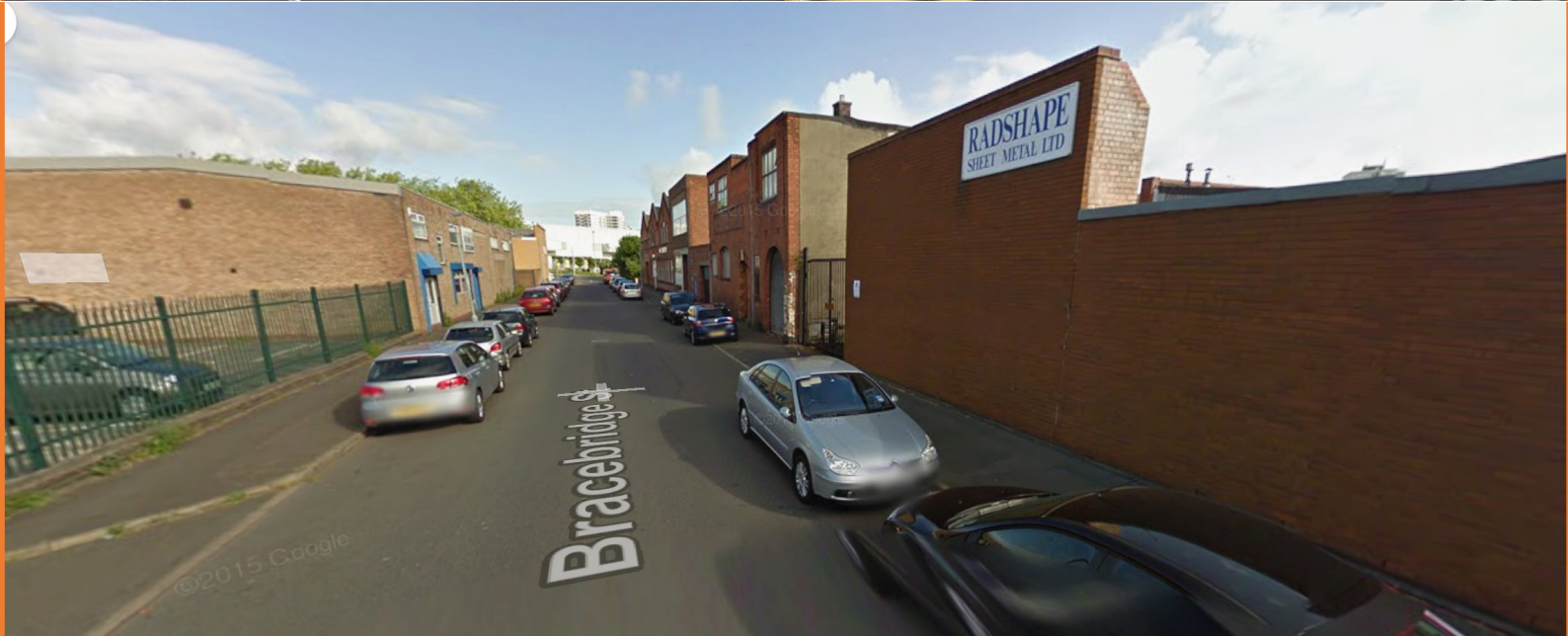
Yard A | Radshape | Shefford Rd | Birmingham | B6 4PL